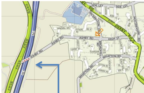
BGCL Site Compound and Office

Buckingham Group Contracting is an active member of the Considerate Constructors Scheme and full details of the Scheme are posted near to our site entrance for your information. Please find enclosed a flyer, which contains information on the Scheme and explains what it means for our company to be registered.